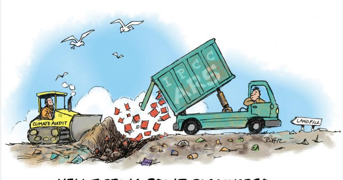
NEW TIPPING POINT DISCOVERED

http://iceagenow.info/2013/09/green-energy-paying-eat-ice-cream-menu/